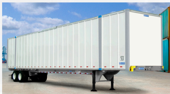
STEEL PLUS (INTEGRATED POST & PANEL DESIGN)