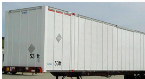
STEEL CLAD COMPOSITE PANEL