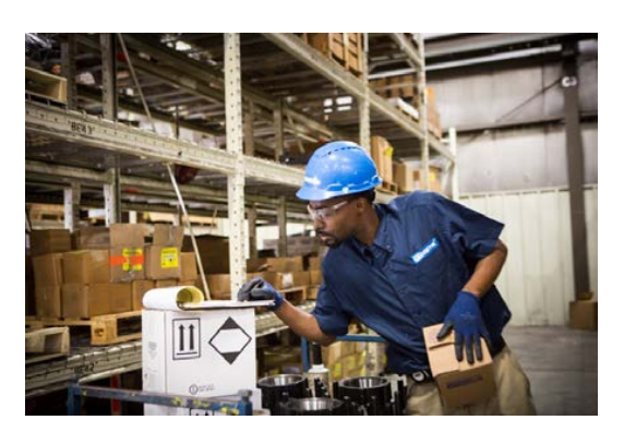
Axles & Components--Brake Chambers